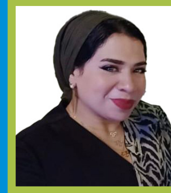
Donia Ezzat Diamonds